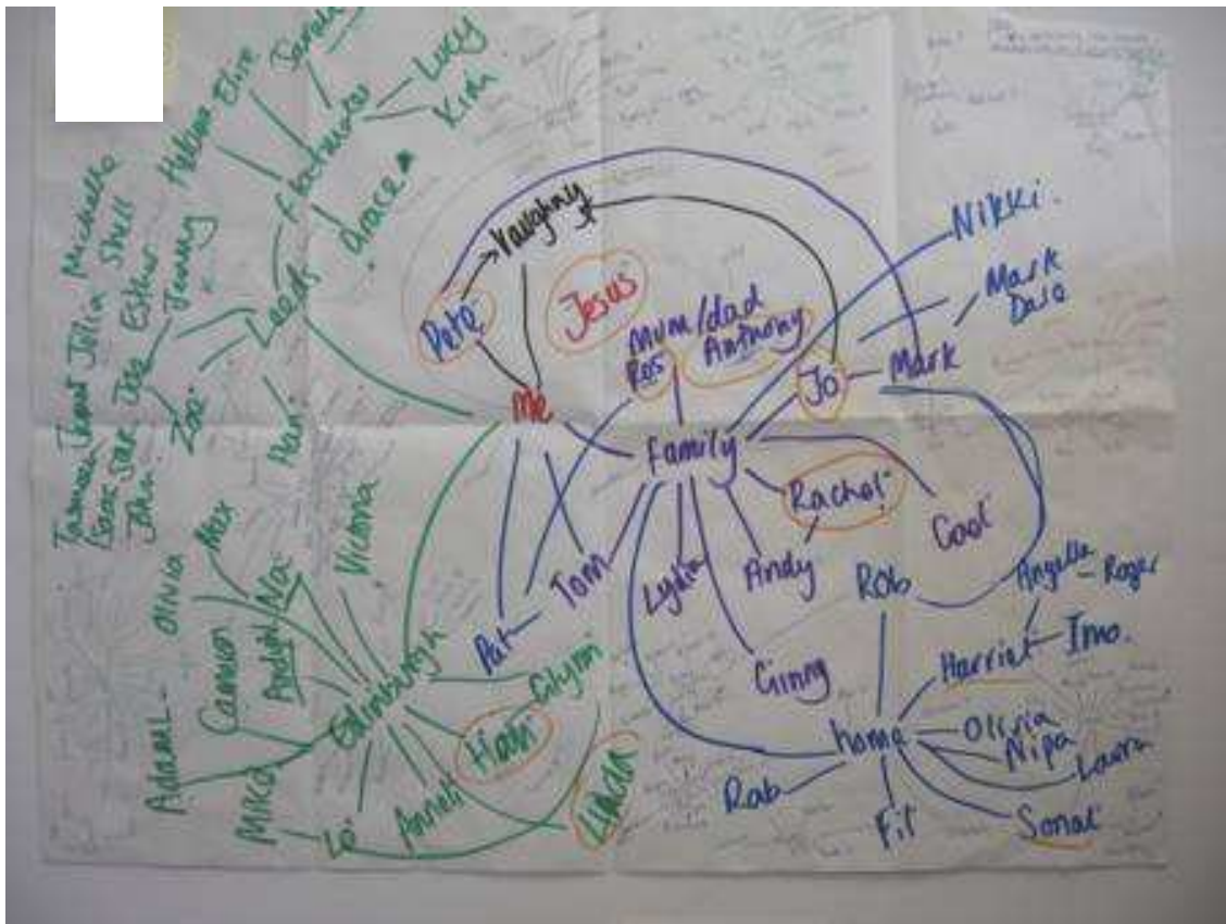
Figure 2: A participatory map from research to investigate social networks

The tangibility of the map is an important feature. This allows the interviewer and participant to return to features of the map in the interview and subsequent interviews to unfold the process of description—elaboration—theorisation. Figure 2 is an example of a participatory map, where the participant has chosen different colours to represent different categories in the map and mapped out relationships between the individuals and places considered.